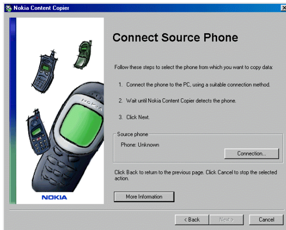
Figure 1. Connecting source phone and selecting the connection type for it.

The process of copying data between the Nokia 6110 and the Nokia 6210 is briefly illustrated below: