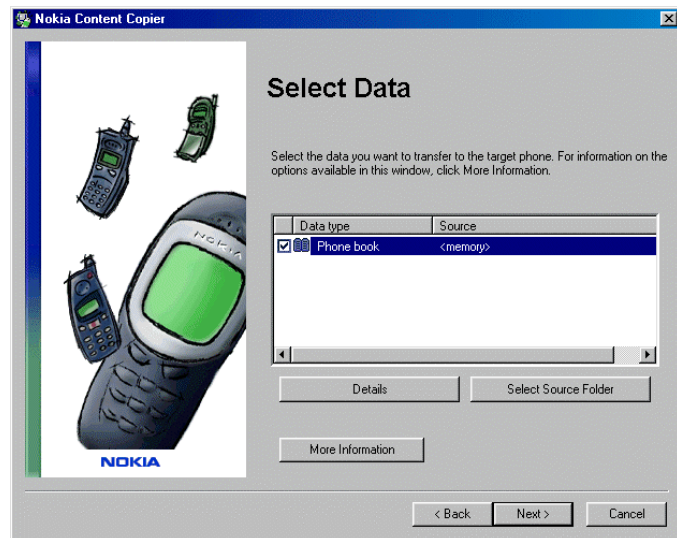
Figure 4. A few steps later, when you begin transferring data to your Nokia 6210, you will be asked to select the data you want to transfer. You can also edit the Details of the Data type as shown in the next figure.