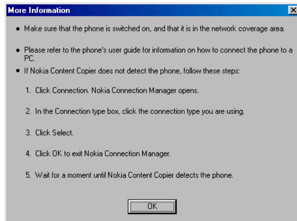
Figure 2. By clicking the More Information button you will receive more information about connecting your phone.