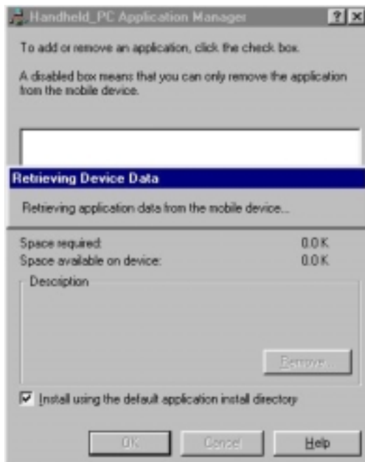
Figure 3. Connecting to Windows CE device.