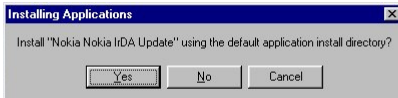
Figure 4. Installing applications.