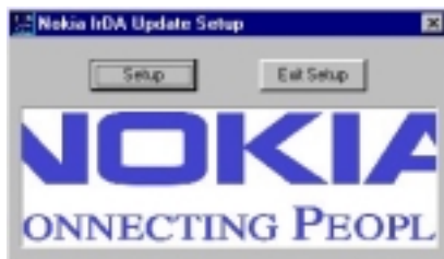
Figure 1. Nokia IrDA Update Setup.