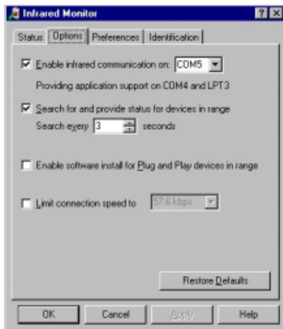
Figure 1. Windows 95 Infrared Monitor (Ms IrDA 2.0)

8. Now you should have a working IrDA connection. You can create a short cut from Irmon.exe to your desktop or put it in your startup directory.