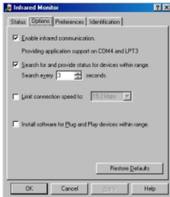
Figure 3: Windows 98 Infrared Monitor (Ms IrDA 3.0)

The Windows 98 installation/update software should automatically detect if IR hardware is present and activated in your computer and install the required files for IrDA support. When getting a new PC with pre-installed Windows 98 it should also have IrDA properly configured if IR hardware is present. Once IrDA support is properly installed on your computer the modem and dial-up networking settings are similar to Windows 95.